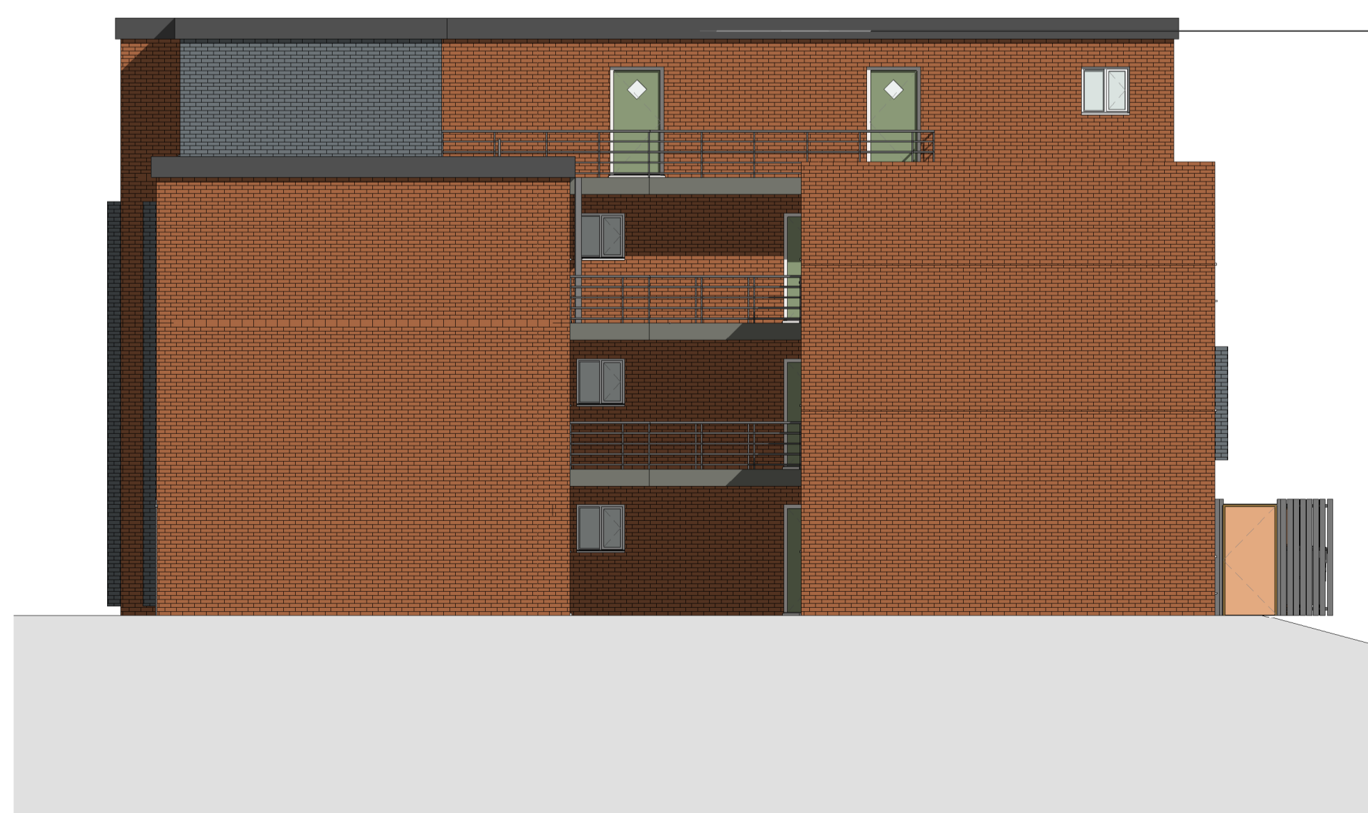
Elevation 4 - a