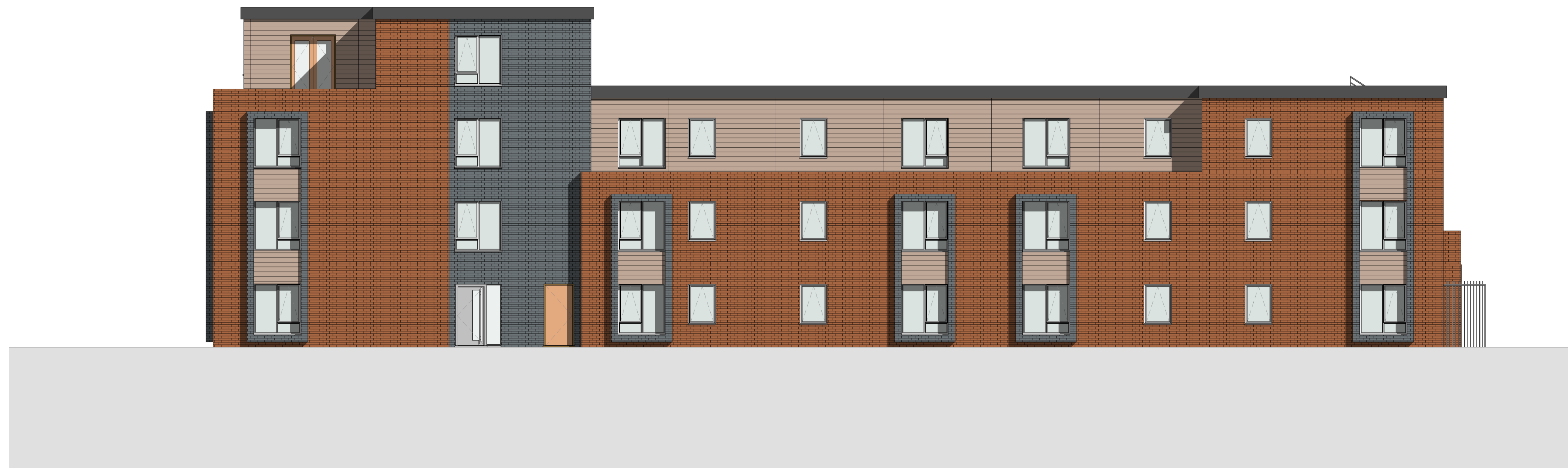
Elevation 1 - a

In line with current industry norms, our Professional Indemnity Insurance specifically excludes Fire Safety. Our clients are requested to ensure that they have their own adequate cover arrangements regarding all Fire Safety related liabilities for their properties.