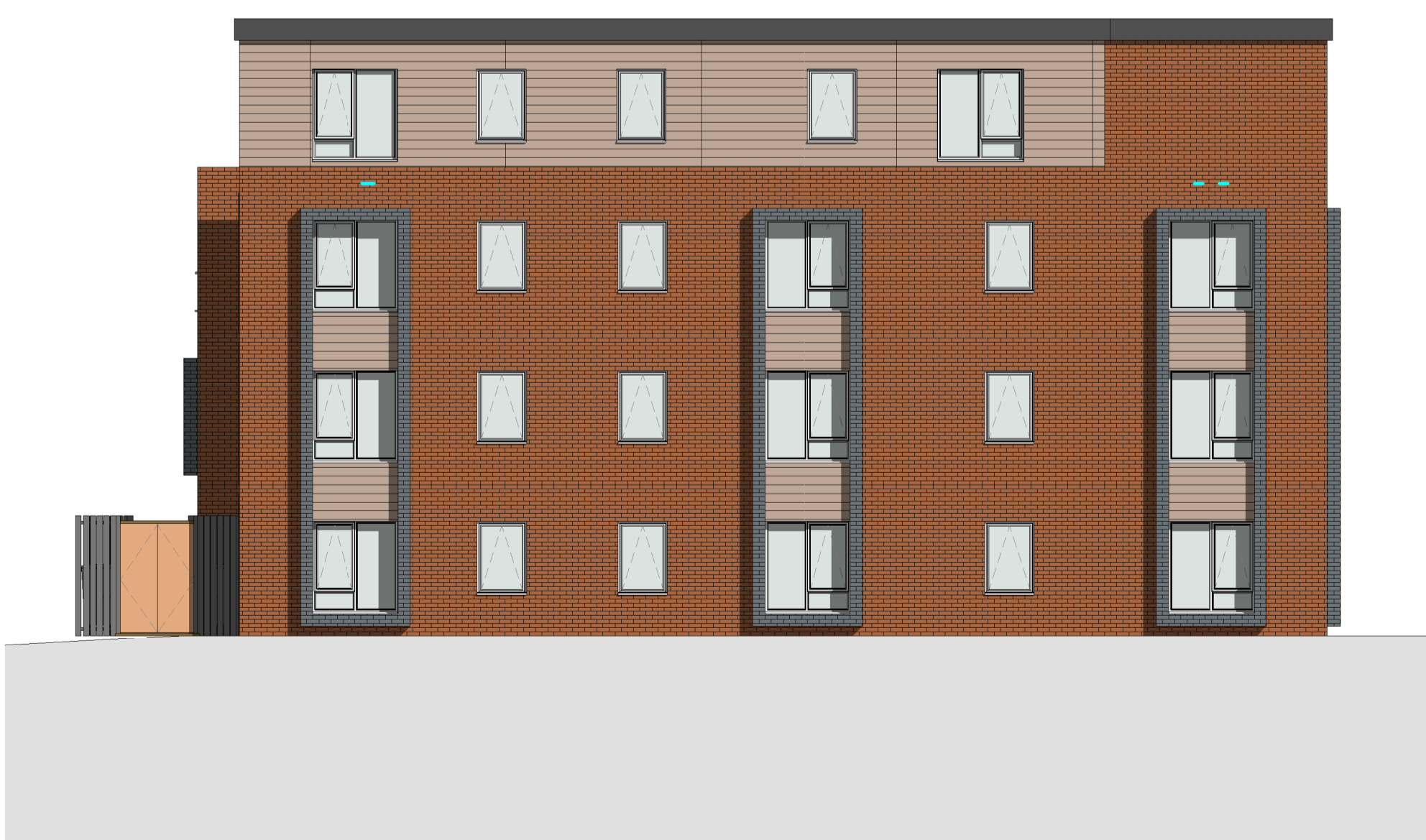
Elevation 3 - a